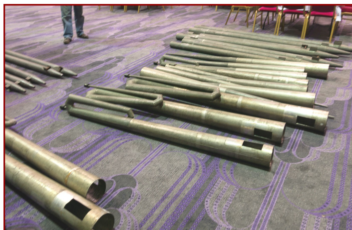
Above: Some of the cleaned pipes before being move to the organ chambers or storage