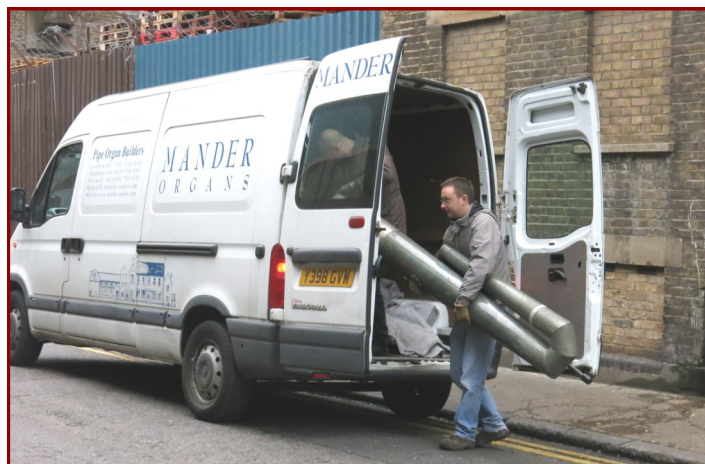
Above: One of three loads of pipes are unloaded

This was a busy and exhausting day, due to the need to manhandle heavy pipes up 53 stairs, but it resulted in an important task being completed.