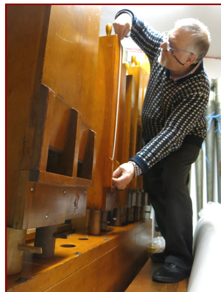
Right: A check is made on a wooden pipe in the upper Main chamber