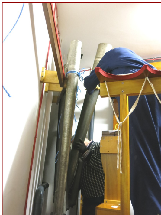
Above: Ophicleide pipes are installed in the Upper Main organ chamber