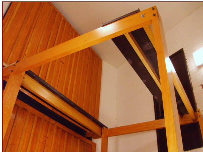
The upper level in the Solo chamber, to which will soon be added windchests that are already restored

Plans are also in place to restore the Solo chamber shutter mechanisms so they are ready when needed for installation.